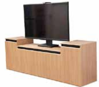
Side by side with CR3000EX (Sold separately) (70" TV shown)